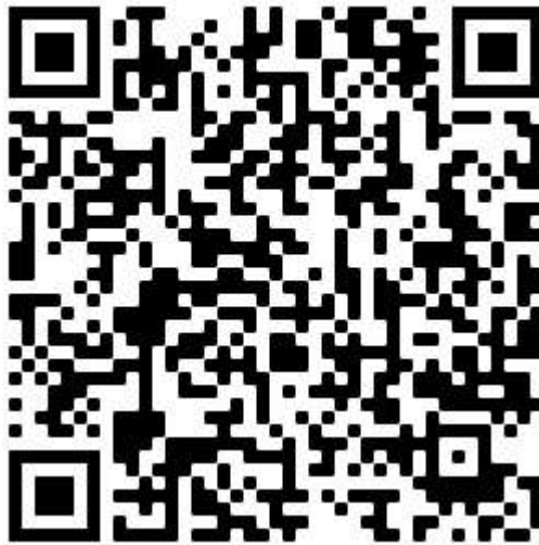
Spring Sport QR Code

The visiting team must show proof of a screening log to the game manager proving that all coaches and athletes have been screened before entering the home schools' facilities.